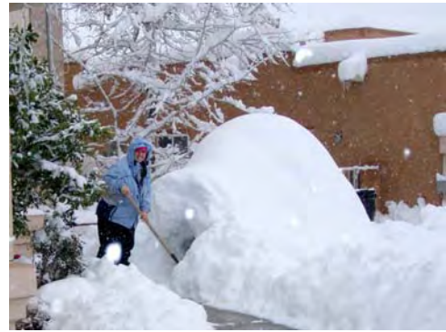
Neighbors helping Neighbors during the major snow storm shoveling driveways, and walkways. Kaye Lynn Robinson and her family built an Igloo for the kids to play in. “Everyone, kids & adults loved it Kaye Lynn.”

co-development project to be known as Hope Plaza. The project will contain office and church buildings with common architecture. The Church itself will seat 300 people per current plans. The initial construction will be the church itself, then two office buildings with a cell tower. Proposed plans will be available for viewing at the meeting 3-6-07, 7:00 PM